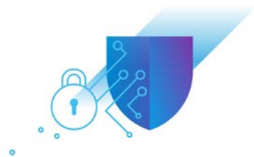
Deliver, Manage & Secure Endpoints