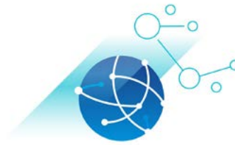
Optimize the Network Edge