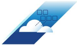
Scale Access to Apps & Data

VMware is actively engaged with thousands of customers globally, addressing unique change challenges and helping drive recovery, growth and innovation outcomes. In this together effort, we've identified key solution attributes leading to more resilient and flexible organizations.