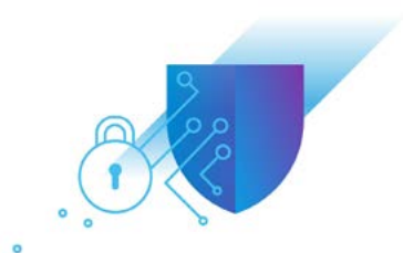
Deliver, Manage & Secure Endpoints